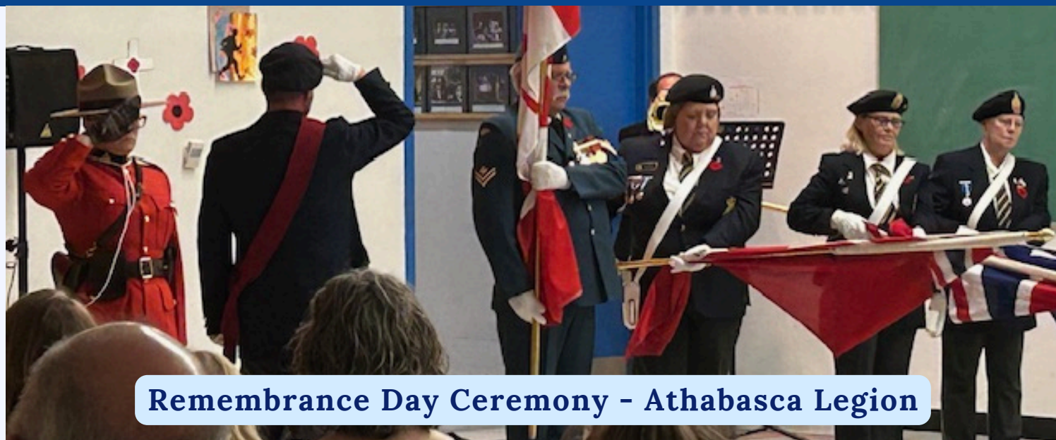
Remembrance Day Ceremony - Athabasca Legion