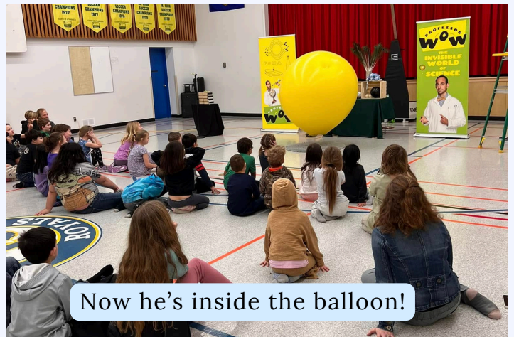
Now he's inside the balloon!